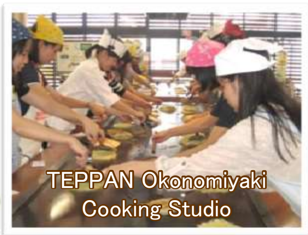
TEPPAN Okonomiyaki Cooking Studio